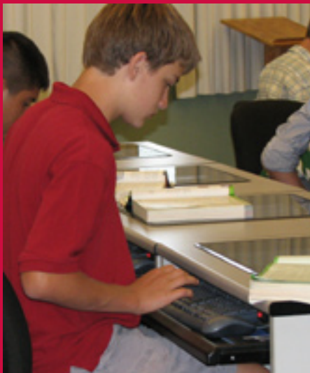
The William P. and Carol Foley, II, Computer Technology Lab